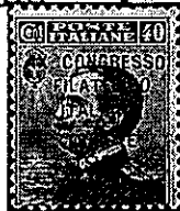
Italy #142 A-D Lot x152