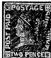
Mauritius #14B Lot 379